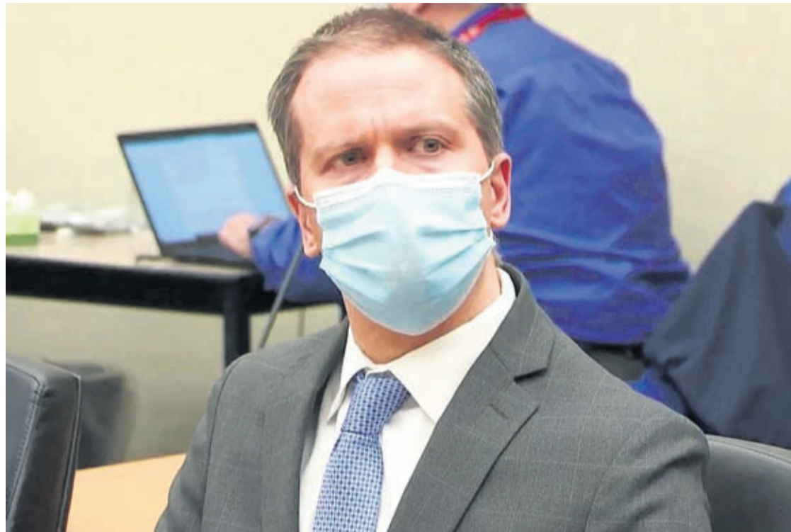
In this April 20, 2021, file image from video, defendant, former Minneapolis police Officer Derek Chauvin, listens to verdicts at his trial for the 2020 death of George Floyd at the Hennepin County Courthouse in Minneapolis.